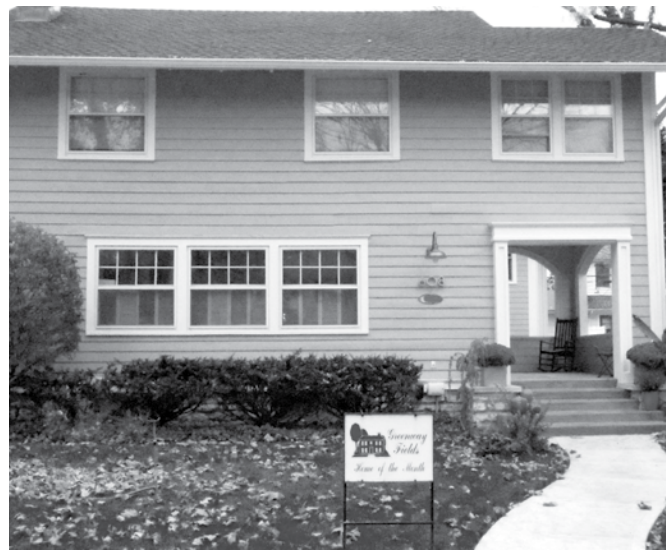
October 608 61st Terrace Maureen Conklin