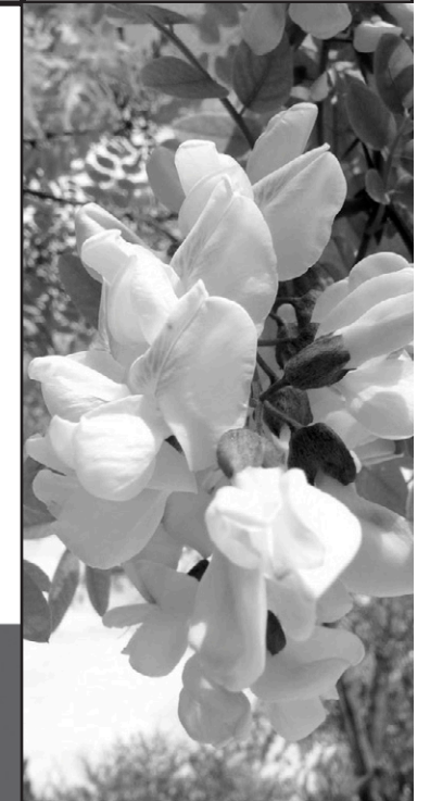
Black Locust Tree Flowers

Call In. Get In. Experience Life. Center of Life Chiropractic.