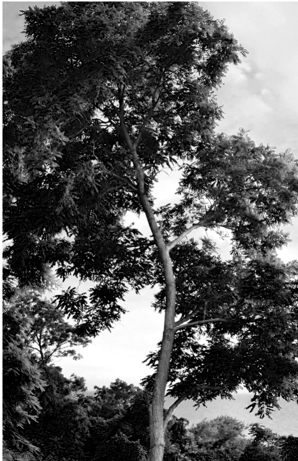
Black Locust Tree ( robinia pseudoacacia )