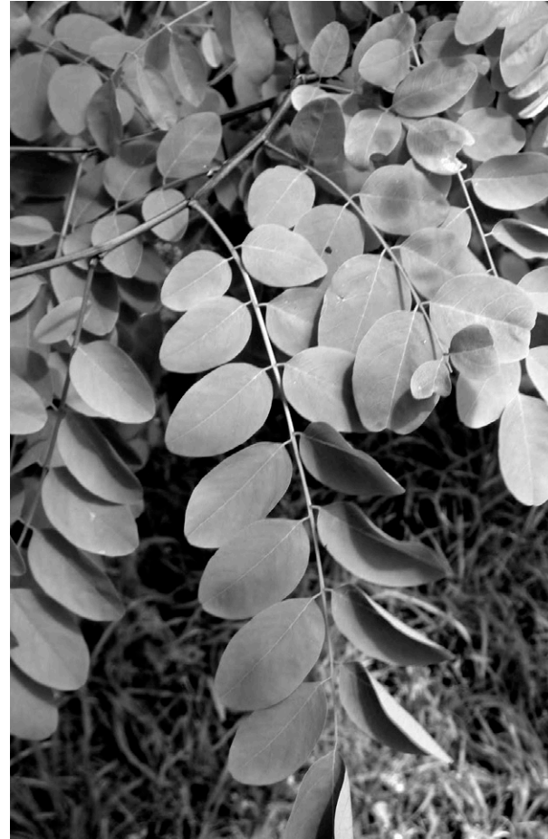
Black Locust Tree Leaves ( robinia pseudoacacia )