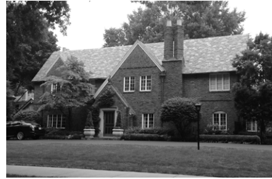
415 Meyer Blvd