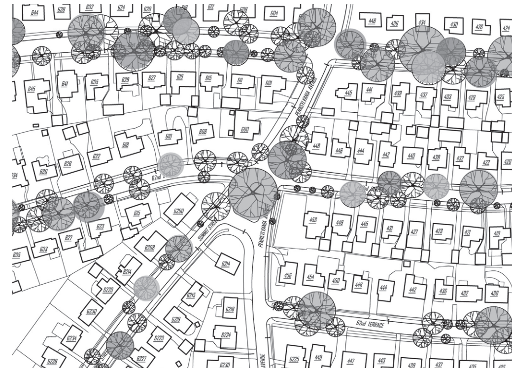
GFHA Existing Tree Survey 2013

HOMES ASSOCIATION NEWS • KANSAS CITY, MO 64113 • 3Q 2013