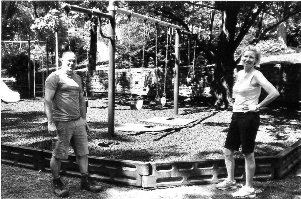
New mulch and infant swing at Greenway Fields Park

HOMES ASSOCIATION NEWS • KANSAS CITY, MO 64113 • SUMMER 2017