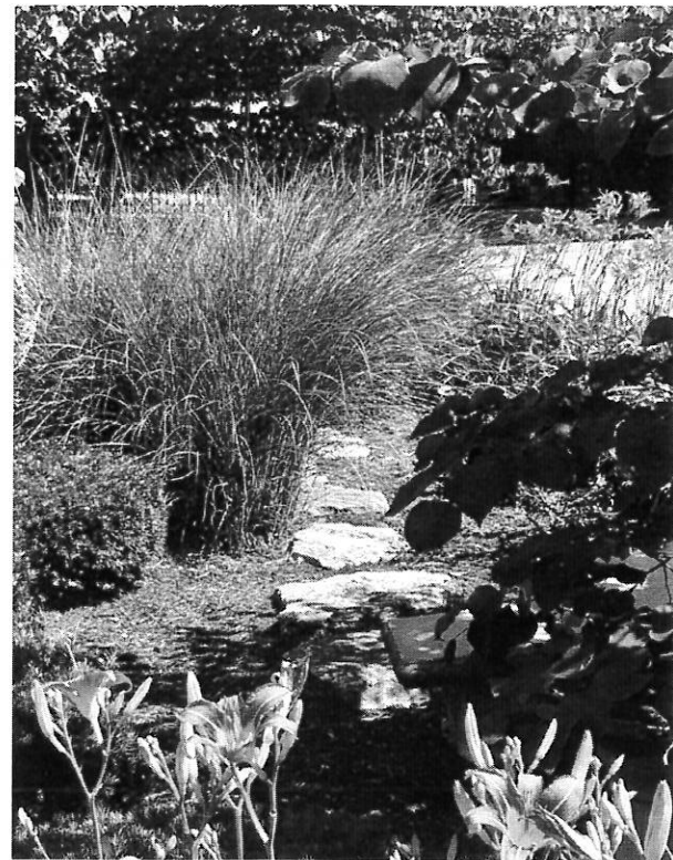
Monkey Island landscape improvements

in turn, led me to become more acquainted with the visionary real estate innovator, J.C. Nichols. He began with treeless fields and swampy stream beds, and from those he created beautiful neighborhoods and shopping districts. He created spaces for schools, churches and community parks. Even seemingly small things, like traffic islands, landscaping, public art and street design were introduced to enhance the residential quality. Perhaps most impressive of all is the sustainability of the neighborhood. Nichols always maintained he was building homes to last one hundred years, and now in 2017, we celebrate the Greenway Fields neighborhood's centenary.