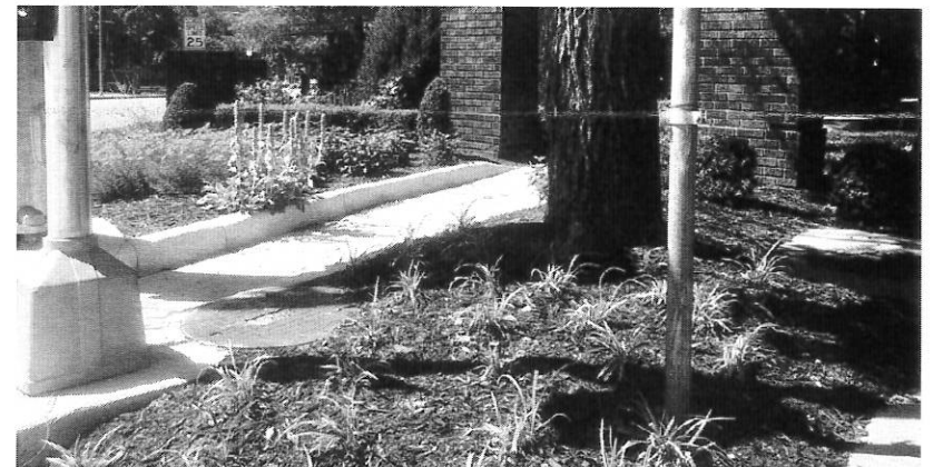
Greenway Ter entrance landscape improvements