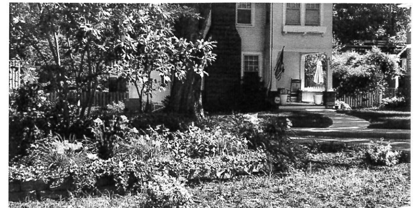
Greenway Ter traffic circle landscape improvements