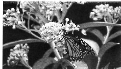
Monarch Butterfly on Swamp Milkweed

Visit the eight acre Anita Gorman Conservation Discovery Center, an urban oasis at 4750 Troost or the New Native Plant Gardens at Loose Park, to listen to the birds sing and see for yourself the beauty of Missouri Native plants. The next time you want to add something to your landscape, pass on the garden centers at big box stores and buy native plants. The birds, butterflies, and bees will thank you!