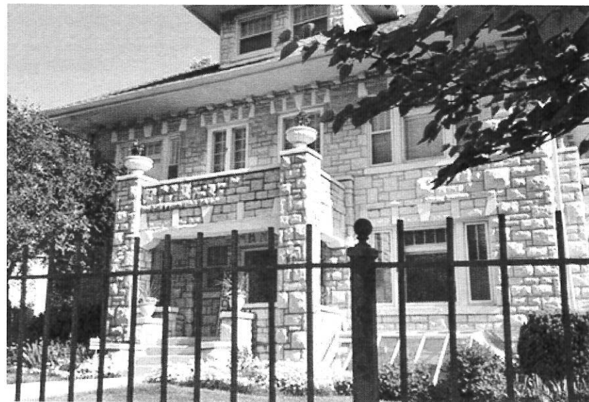
The 400 at 400 W 63rd St

The stone for the home was quarried near Joplin, MO. It's unclear if it was cut in blocks and then transported or slabbed and sized once it reached Kansas City. The limestone sweats and sometimes forms mini stalactites under the porch eaves, which is always a conversation starter. Originally built as a six bedroom two bath home, it now has three rentable suites with private bath, two dining rooms, multiple common areas and full living quarters on the lower level.