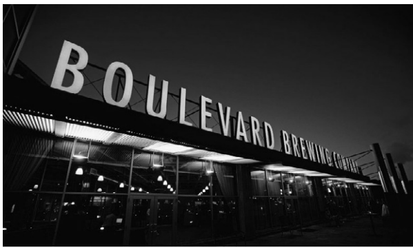
Boulevard Brewing Company