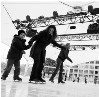
Crown Center Ice Terrace