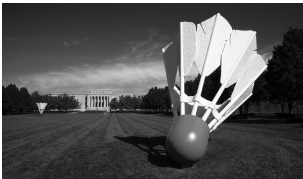
Nelson-Atkins Museum of Art

In Brookside, Avenue's Bistro's lounge expansion Cove is opening November 17th.