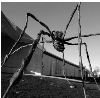
Kemper Museum of Contemporary Art