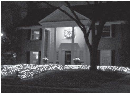
Most Classic: 641 West Meyer Blvd