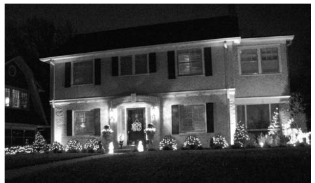
Most Festive: 6410 Summit St

Elections are held at the annual meeting on February 7th. If you're interested in serving on the Board, please contact any of the current Board Members or email the board at board@greenwayfields.org to put your name on the ballot.