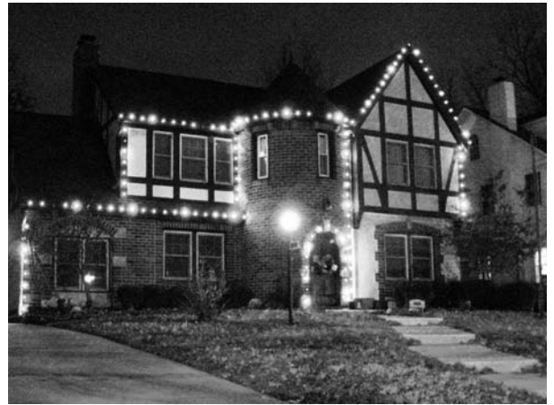
Most Architectural: 6426 Washington St

You can once again satisfy your sweet tooth with Baskin-Robbins 31 Ice Cream Store/Topsy's, which relocated to a newly renovated space at 101 W. 63rd Street, next door to Brookside Party Warehouse. When the big game is on, stay in the neighborhood and watch with your friends at your favorite place. The Brooksider Bar & Grill (6330 Brookside Plaza) has re-opened under new ownership.