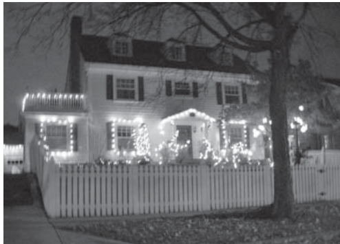
Best in Show: 409 West 62nd St