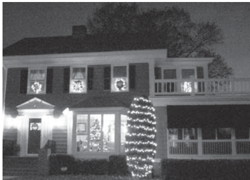
Most Elegant: 644 West 61st Ter