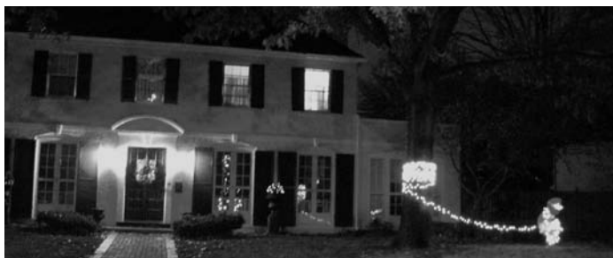
Most Original: 6325 Valley Rd

So, in a nutshell, let's all follow the Golden Rule. Treat your neighbors as you would like them to treat you. A peaceful neighborhood is a happy neighborhood. And who couldn't use a little more happiness today?