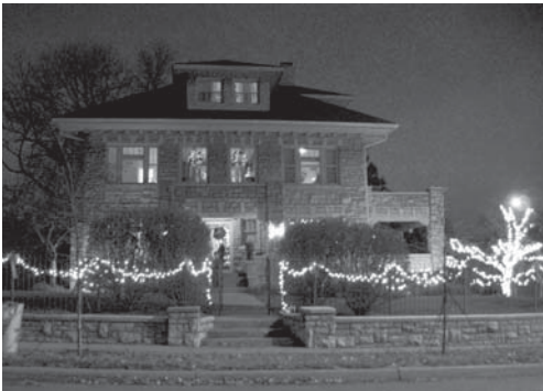
Most Elaborate: 400 West 63rd St

HOMES ASSOCIATION NEWS • KANSAS CITY, MO 64113 • 1Q 2015