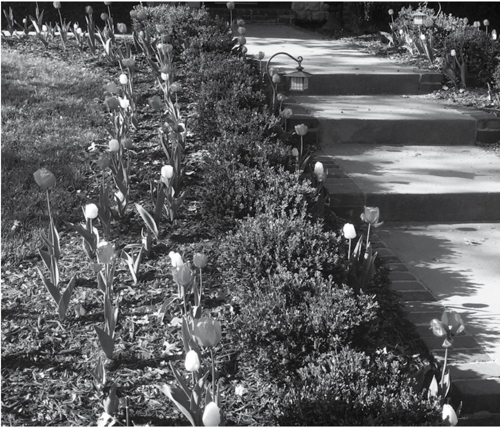
Blooming Tulips – 801 W Meyer Blvd

HOMES ASSOCIATION NEWS • KANSAS CITY, MO 64113 • 2Q 2015