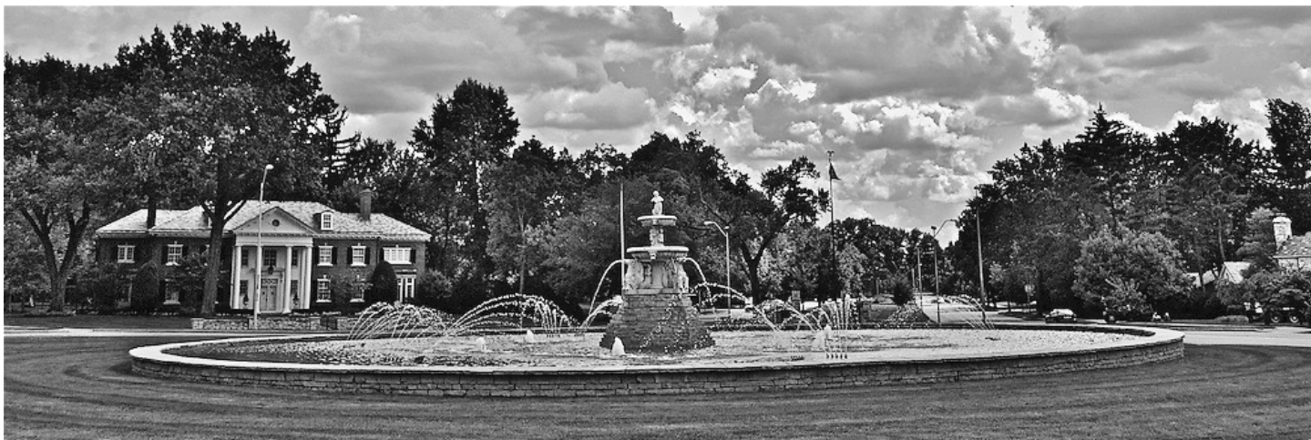
Meyer Blvd Fountain